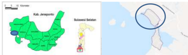
Figure 1. Bahari Beach village location

The population in this study is all wastewater originating from household activities. The sampling technique used was purposive sampling technique, and the sample in this study was household wastewater (liquid waste from the bathroom, kitchen containing leftovers, and also from the washing place). Observation of events in naturalistic or in situ situations. The observation place is divided into 3 places, in high-rise housing units in the form of stage and non-stage, residential neighborhood roads and beaches. The analysis technique in this study was carried out in several stages, according to Miles & Huberman (2014) that analysis techniques data in qualitative research includes: collecting data, reducing data, presenting data (Presentation of data is analyzed in the form of short descriptions, tables, charts, networks, graphics) and drawing of conclusions.