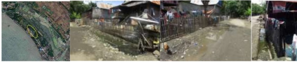
Picture. 5. The drainage system on environmental roads

The environmental drainage network on the side of the road is limited, only in some places has drainage channels and is cut off continuously. As a result, the water from the houses flowing through the network is clogged and if it is full, it spills into the street.