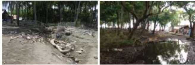
Figure 6. Drainage conditions from settlements to beaches

The environmental drainage network on the side of the road is limited, only in some places has drainage channels and is cut off continuously. As a result, the water from the houses flowing through the network is clogged and if it is full, it spills into the street.