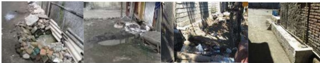
Figure 3. Disposal system in non-stage housing units

There are several forms of household wastewater disposal systems on stilt house. Let it naturally seep into the sand without doing any effort (1,2). Water from the service area falls freely under the house. This occurs in housing units established in the coastal area (within 15 m of coastal water). There is also a flow from the service area to the backyard through a pipe (3,4), and the dirtiest is seen to make shallow holes under the service area and only give a stone fence or makeshift board, so that if the wastewater has exceeded the capacity limit of the hole it will flow to the neighbor's page (5).