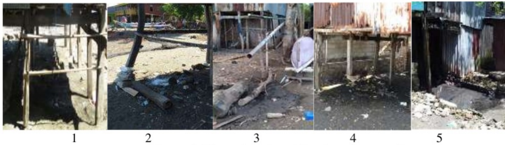
Figure 2. Disposal system at the stage house unit

There are several forms of household wastewater disposal systems on stilt house. Let it naturally seep into the sand without doing any effort (1,2). Water from the service area falls freely under the house. This occurs in housing units established in the coastal area (within 15 m of coastal water). There is also a flow from the service area to the backyard through a pipe (3,4), and the dirtiest is seen to make shallow holes under the service area and only give a stone fence or makeshift board, so that if the wastewater has exceeded the capacity limit of the hole it will flow to the neighbor's page (5).