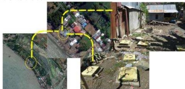
Figure 4. IPAL (Waste Water Disposal Installation)

The community makes a channel from the service area to the drainage holes located behind the house. Average hole depth of 30 m and 1/2 m in diameter, and some residents guarded the hole with stones in order not to overflow to the neighboring yard. If the water in the hole is full, the occupants will draw onto the road. The average drainage of the water reservoir is done twice in a week. But in the rainy season, the drainage is not done because the water is allowed to overflow into the yard and hopes rain or flood will sweep away the dirty water. In principle, it is accommodated, allowed to seep, and if it is abundant, it is then thrown into the yard or to the beach.